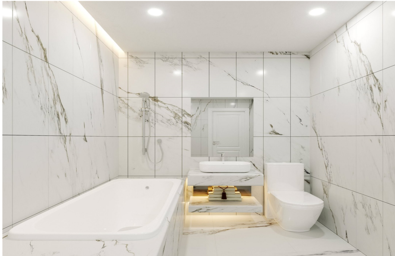
Illustration Only 2