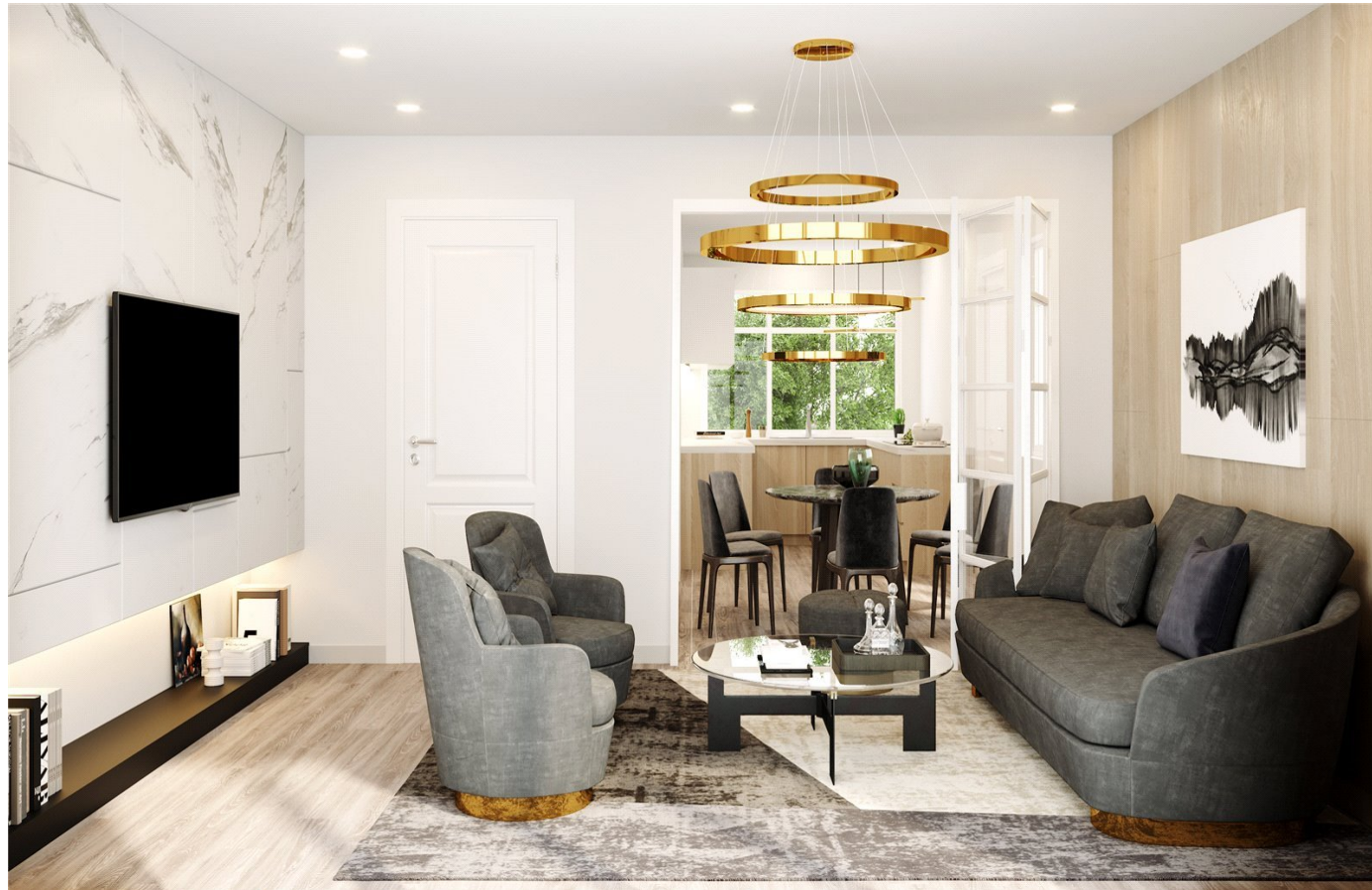
Illustration Only 5