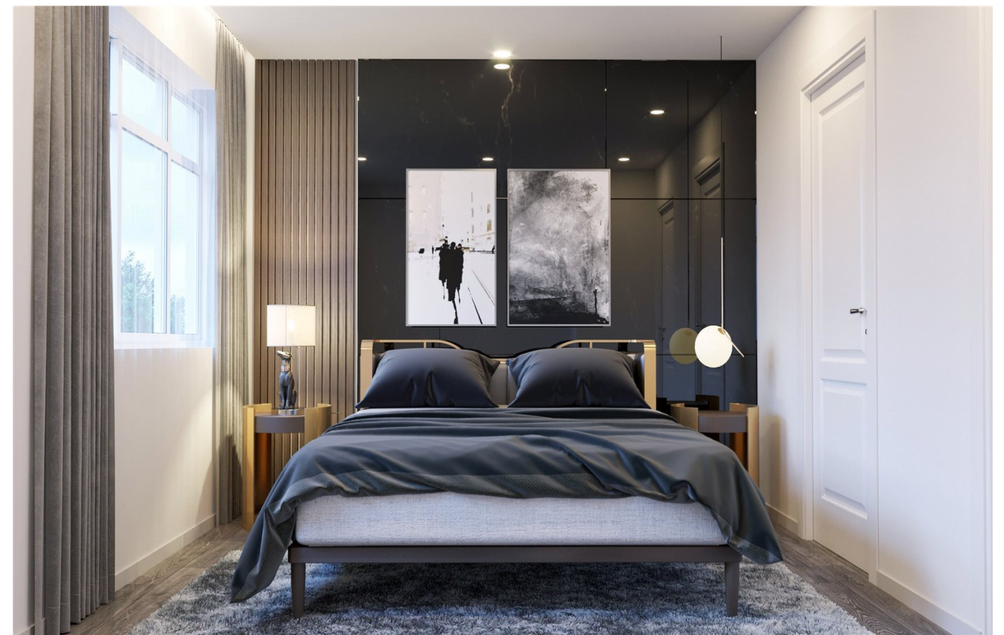
Illustration Only 4

*New Development* Set within this semi-rural location, surrounded by fields, is this fine development of just four semi-detached family houses. Each home comprises; three bedrooms, bathroom, cloakroom, living room, kitchen with open-plan dining area (could separate). They all benefit from a large rear garden and two private off-street parking spaces. The amenities and transport connections of both Upminster and Harold Wood are nearby, making these the ideal purchase for those families seeking a new home that they can move straight into that's secluded in its location but still close enough to a town for schooling and commuting. Help-To-Buy scheme ready. (CGI images for illustrative purposes only).